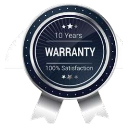
Our Industry-Leading 10-Year Limited Warranty Guarantees Unsurpassed Quality