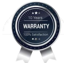
Our Industry-Leading 10-Year Limited Warranty Guarantees Unsurpassed Quality